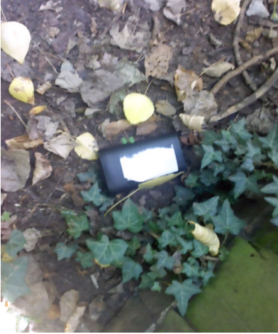
Drug Sharps Box - Location Two