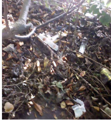
Drugs paraphernalia – Location Two